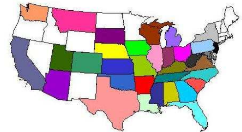
States where GCI has performed services.