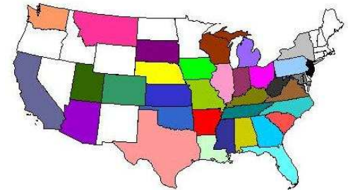
States where GCI has performed services.